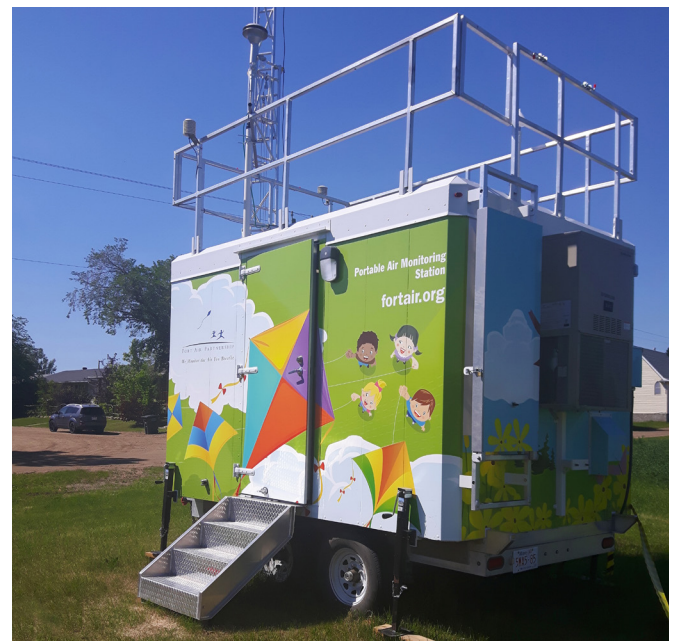
Air monitoring station

Fort Air Partnership also has 47 other monitors that are called passive monitors. In these monitors, air flows past a filter. The filters are collected once a month to see how much of a pollutant is on the filter. These monitors are located next to fields and roads.