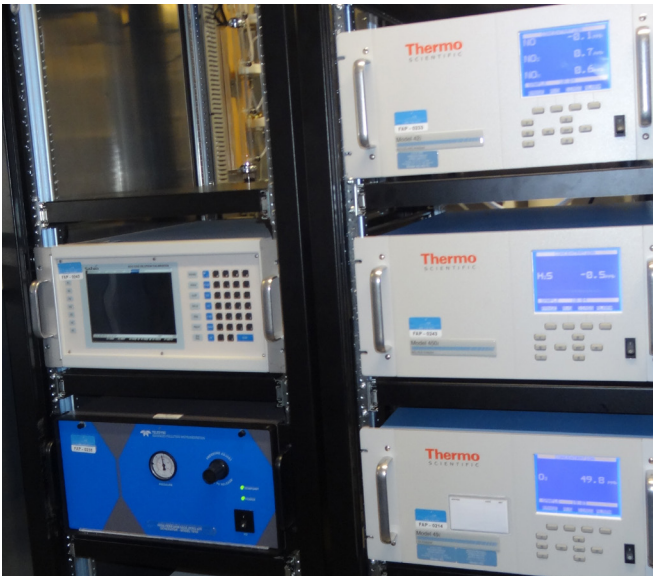
Air monitoring scientific equipment inside a station